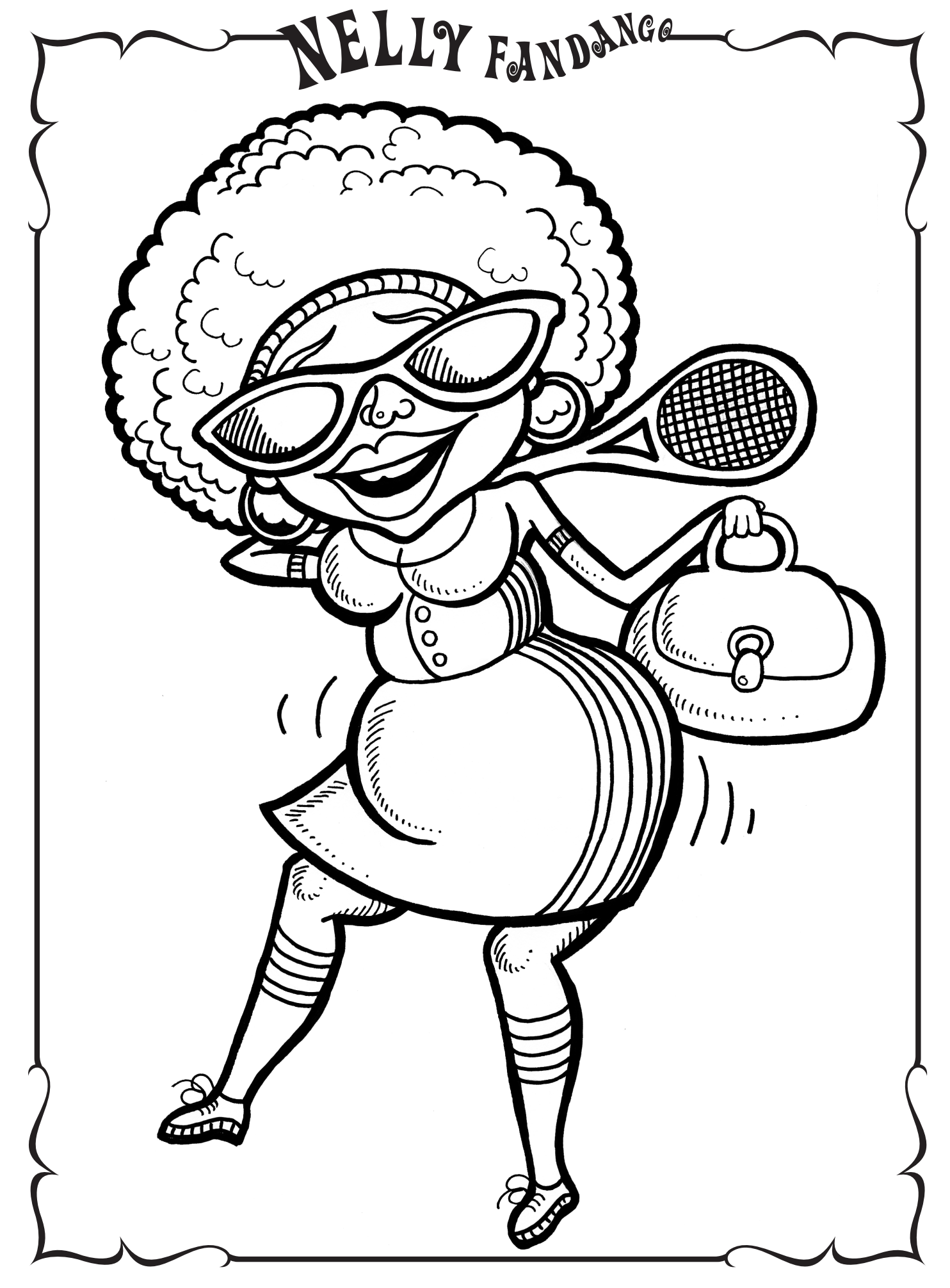
Mrs Wigglebum liked to sit by the window...